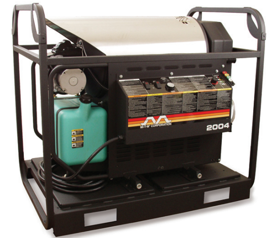
HHS-2004-1E4G shown with skid frame (HX-0196) option